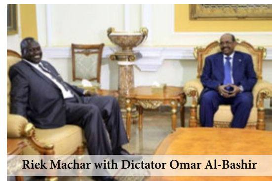
Riek Machar with Dictator Omar Al-Bashir

Sudan. Ministers in South Sudan express their frustration to us. At independence, ex-US president Jimmy Carter persuaded President Salva Kiir to appoint Riek Machar vice president. The new South Sudan government was also persuaded by Carter to declare themselves a secular state, to not have any prayer at parliament and to adopt the secular textbooks provided by UNICEF for their schools.